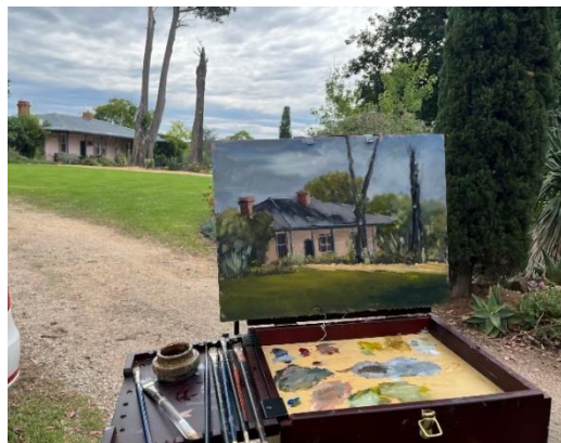
Looking across to the house